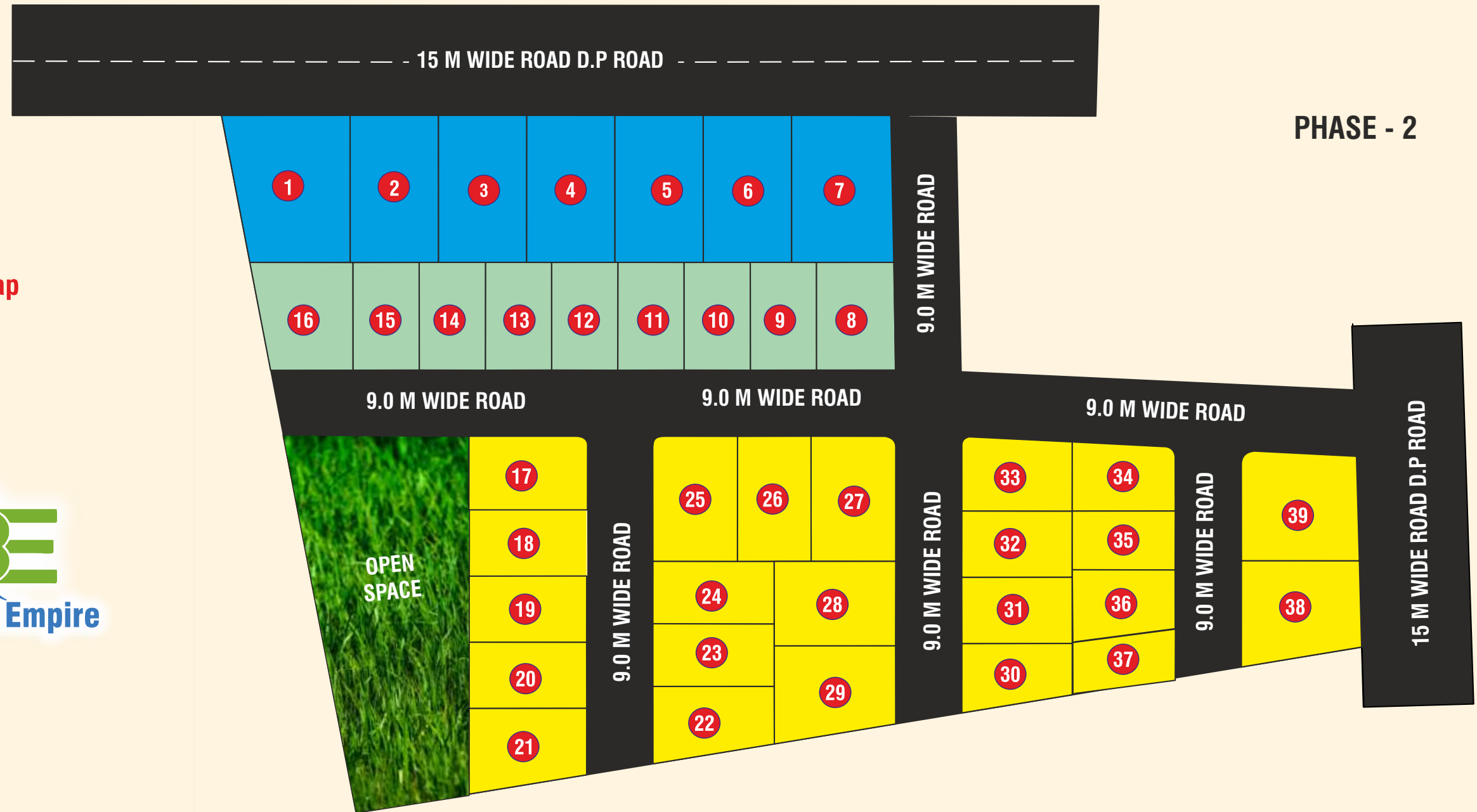
SCHEDULE OF PLOT : PHASE - 2